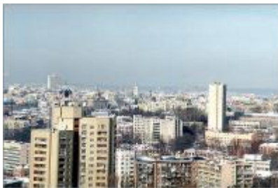
Kyiv – The tall buildings are an example of the kind of apartment we will be living in.

I prayed fervently that the Lord would direct us through the response to that letter, and His answer was simply fantastic! I have never paid attention to the mail. Obviously, if you don’t write letters, you don’t expect to receive them, either. Now there were a few letters in our mailbox nearly every day. We savored the renewed contact with dear family and old