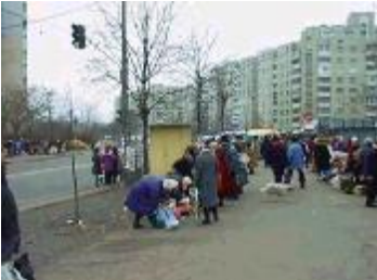
Typical Scene in Kyiv Apartments in background