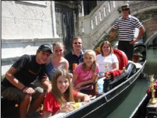
Unfortunately, our family could not convince our Venetian gondolier to take us all the way back to Ukraine!

day, and there was nowhere to get relief from the heat, not even in the hotel. Plus, it was a financial disaster that seemed to continue on and on like toppling dominoes. It happened on a Saturday, and we would need to stay in a hotel till Monday, when the mechanic would look at the transmission and tell us how long the van would take